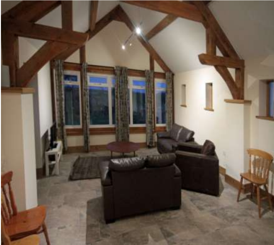
A lovingly-restored four-bed 19thc dairy farm and smithy